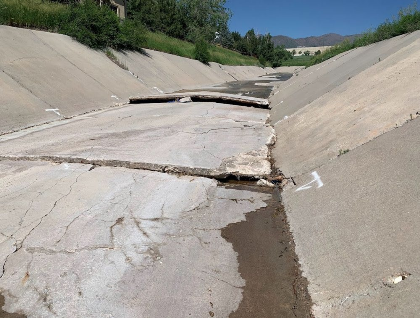
South Douglas Concrete Channel