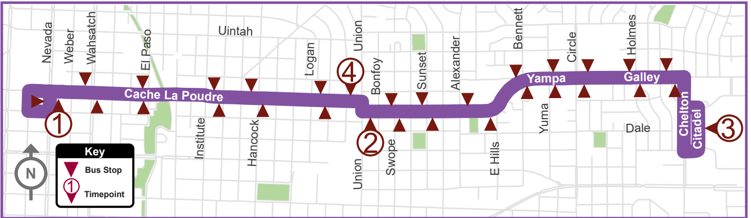
Numbers on map correspond to numbers on schedules.